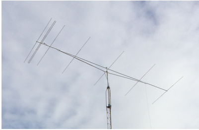
A 7 element OWL Super-Light 50MHz / 6m DX Yagi / low noise Yagi