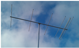
A 6 element OWL (Optimised Wideband Low Impedance) Super-Light Yagi for 69.9-70.5MHz