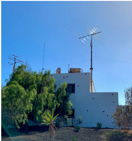
The XR7 installed at EA8BFK