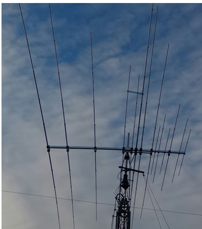
The XR7 installed at G0MTQ

Average Gain per band @ 20m above average ground: 11.24dBi