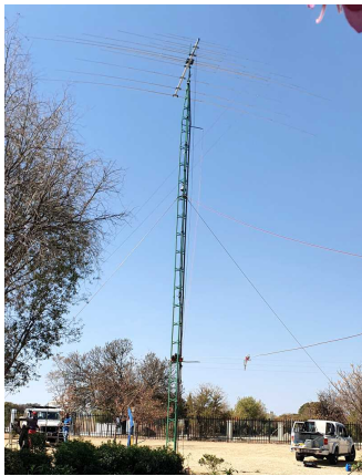
The new XR7