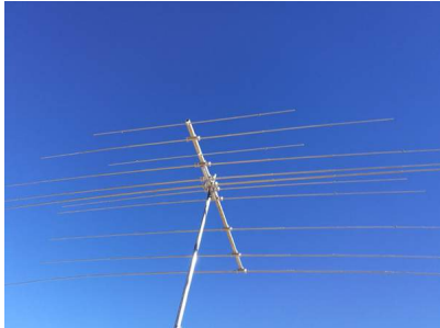
The new XR6 MkII being tested at our factory

Average Gain per band @ 20m above average ground: 11.24dBi