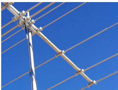
View of the 50mm (2") square boom and element holders on the rear of the antenna