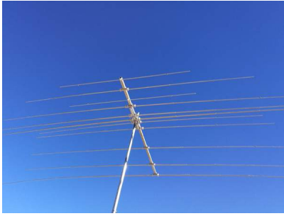
The new XR6 MkII being tested at our factory