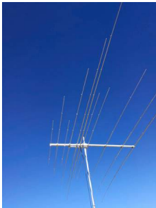
The XR6 MkII side view showing the short (3.5m) boom