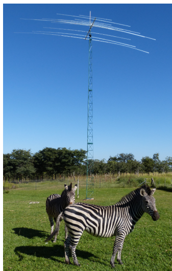
XR6 Mk1 version, installed at 9J2MM

Contact us to discuss your system/station requirements for a FREE CONSULTATION!