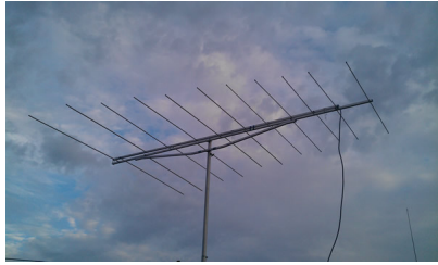
Log Periodic 11 element 45MHz - 72MHz High Performance LPDA - Professional Series