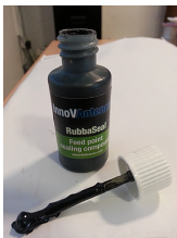
Liquid Rubber Feed Point Sealant 30ml bottle with brush-in-lid Applicator

We have formulated an excellent UV resistant rubber sealant to ensure your feed point is well protected. Unlike enclosures around the feed point which can hold in moisture, this rubber sealant is applied to both coax and terminals at the time of the antenna installation to ensure your antennas feed point remains in tip-top condition for the longest time.