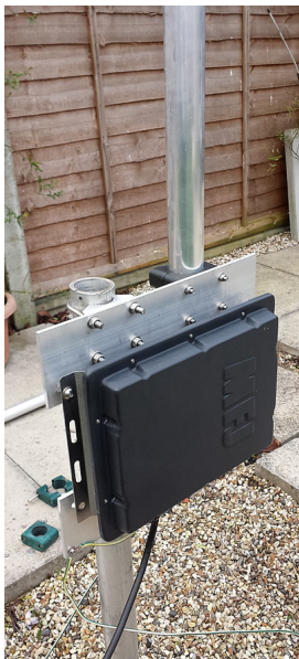
A typical installation with MFJ tuner installed with optional ATU mount fitted (VertiGo 43V pictured)

NOTE: 3" U-bolts will handle a supporting mast up to 65mm diameter