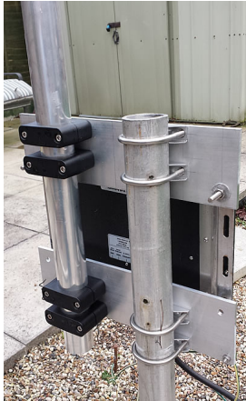
Rear side and mounting arrangement with optional ATU mount fitted (VertiGo 43V pictured)