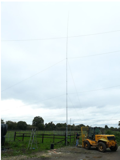
The 66V Vertigo at M0NPK

Why choose an InnovAntennas 66' (20m) self-supporting vertical?