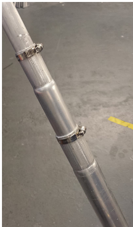
Joins are swagged for maximum strength Marine-grade Stainless Steel fixings used throughout