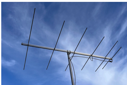
The FMDX-6 on test

A Super Wide Band, High Performance Broadcast (87-115MHz) 6 element Log Periodic Dipole Array