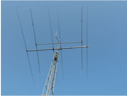
The Delta C-240 above a 20m 4el Yagi for size comparison