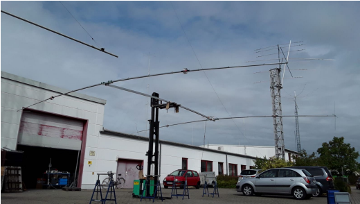
The Delta C-240 without any boom guys to show size and strength.