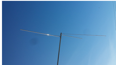
A close-up of the Capacity loaded end sections of the Delta 2-140 and the 'spiral' configuration of the spokes which are 8mm diameter