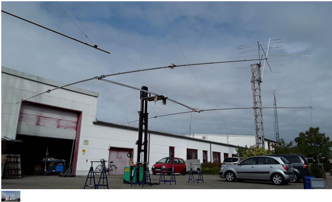
Delta C-240 Compact, HD 40m Yagi. 7m long, 11.5m wide