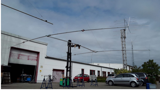
The Delta C-240 without any boom guys to show size and strength.