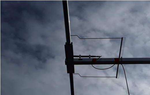
The Large diameter Hairpin of the Delta C-240 that contributes to the exceptional bandwidth of this antenna