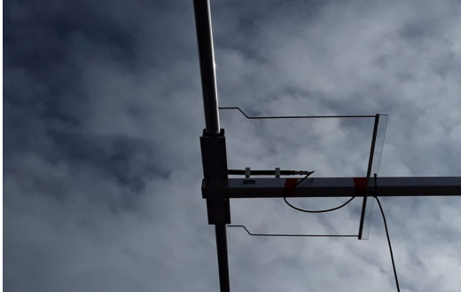
The Large diameter Hairpin of the Delta C-240 that contributes to the exceptional bandwidth of this antenna