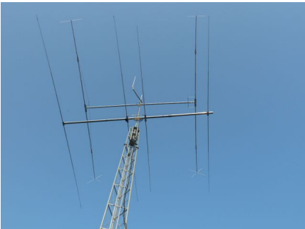
The Delta C-240 above a 20m 4el Yagi for size comparison