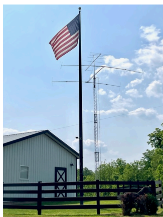
The Delta C-240 below a 50MHz 6el LFA Yagi at K9US