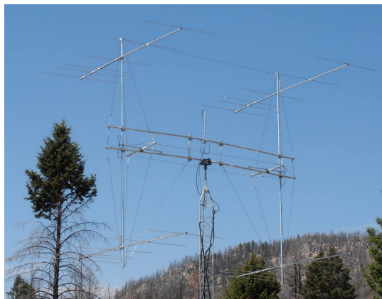
4 x 5el LFA-3 @ KD7DCR

If you require a full stacked system, InnovAntennas can supply all cable, H-frames and everything you need for a turnkey solution. Contact sales 'at' innovantennas.com