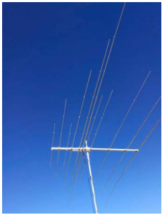
The XR6 MkII side view showing the short (3.5m) boom