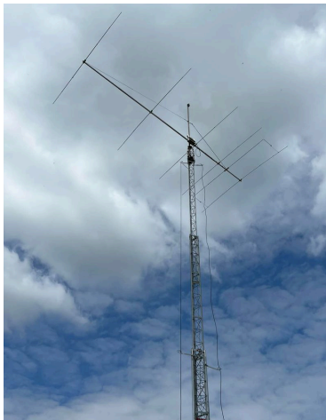
The 6el (set for 28-30MHz) 8.5m OP-DES @ G0FWX installed spring 2022

This antenna has a flat SWR curve covering 27-29MHz at less than 1.5:1 SWR. Bandwidth can be easily moved to cover two other ranges if the standard does not suit, 26.5MHz to 28.5MHz or 28MHz to 30MHz . The super-compact 6el with a huge punch, Take a look!