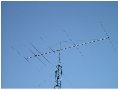
How the OP-DES looks; A 6el 10m/11m OP-DES

Manufactured the right way, not the cheapest way