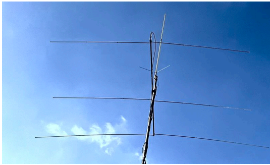
The BOLPA-3 on a tiny 3.6m boom installed and ready to go

If you are looking for the best of the best from both a performance and mechanical construction perspective then look no further, you have come to the right place!