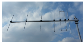
A 6 element low-noise, Professional Series AIS (162MHz) LFA Yagi - For Commercial, Professional and Marine applications