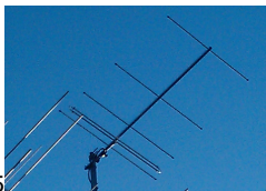
2.5 A 5 element OWL (Optimised Wideband Low Impedance) Super-Light Yagi for 69.9-70.5MHz