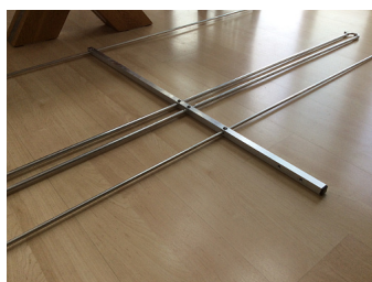
The super-light OWL's have elements connected and thru the boom with a single securing bolt (3el rear mount OWL featured above)

Our antennas are constructed with the best quality materials in order the best mechanical construction can be achieved, not the cheapest and most profitable! Even a digital caliper is used (with an accuracy of .01mm) to measure the elements during production to ensure they are within 0.2mm of what they should be, this ensures they work as well as our software model predicts.