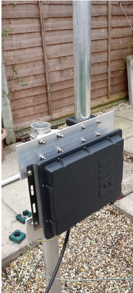
A typical installation with MFJ tuner installed (VertiGo 43V pictured). Optional ATU mount fitted