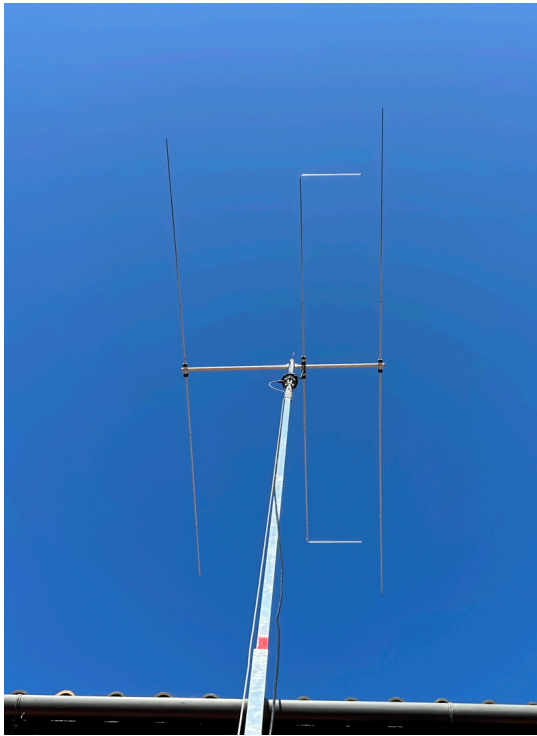
A low-noise 27MHz/28MHz OP-DES Yagi