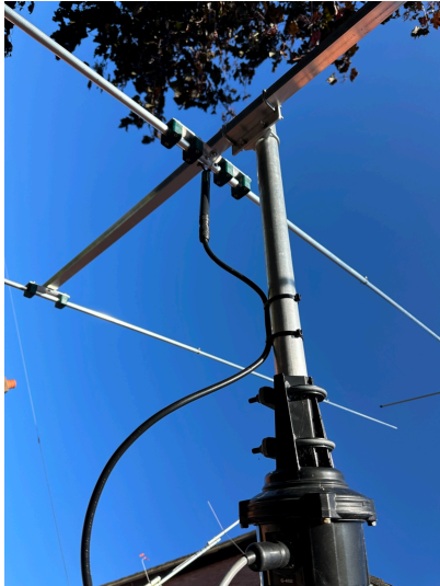
Up close to the feed point with a current balun (InnovAntennas Ferrite Core Balun) installed