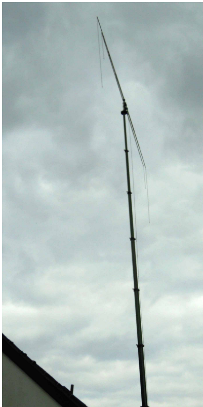
Manufactured the right way, not the cheapest way