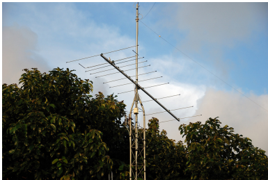
A 11el 88-108 OP-DES

If you want an antenna to last and perform in all weathers without SWR or bandwidth shifting, this is it.