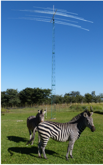
XR6 Mk1 version, installed at 9J2MM

Contact us to discuss your system/station requirements for a FREE CONSULTATION!