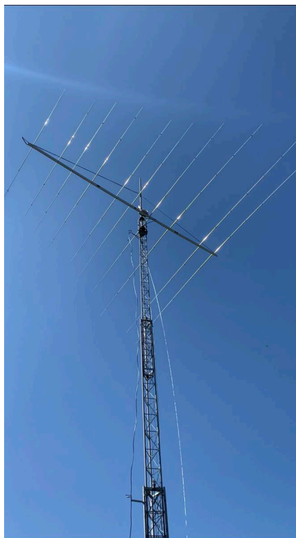
The Bolpa installed at Veteran DX'er Gary, G0FWX who has 323 countries worked before the BOLPA

Garry said 'The BOLPA is amazing, Flat SWR on all the bands'