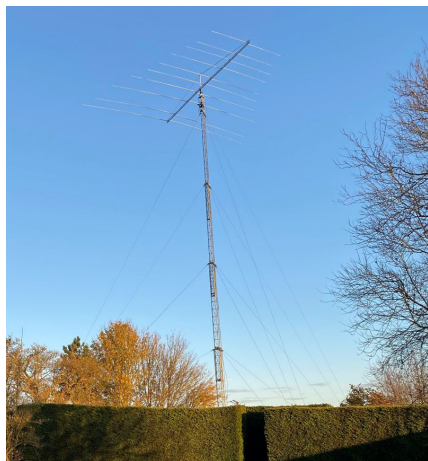
The BOLPA at G2YT - installed at 85'

Garry said 'The BOLPA is amazing, Flat SWR on all the bands'