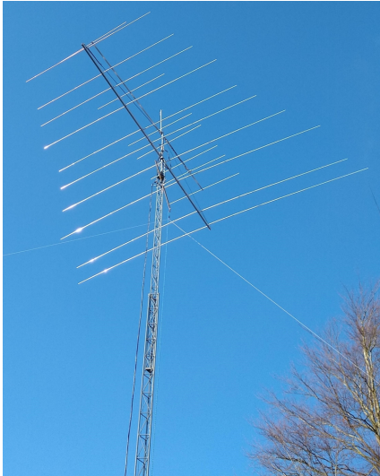
Installed at G1XOW

The Twin-boom feedline of the BOLPA-10 can easily be seen in this image