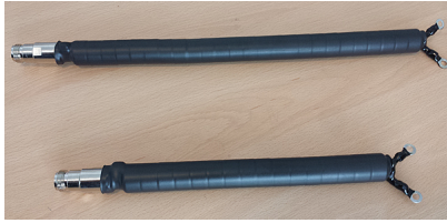
Examples of the InnovAntennas ferrite core baluns

through the driven element and the coax cable can be seen to be radiating too