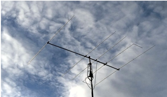
The 5el OP-DES covering all of 10m (28MHz to 30MHz) @ 2E1RDX

Customer Build video showing construction HERE :