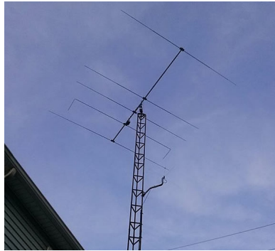
How the OP-DES looks; A 5el 10m/11m OP-DES

Manufactured the right way, not the cheapest way