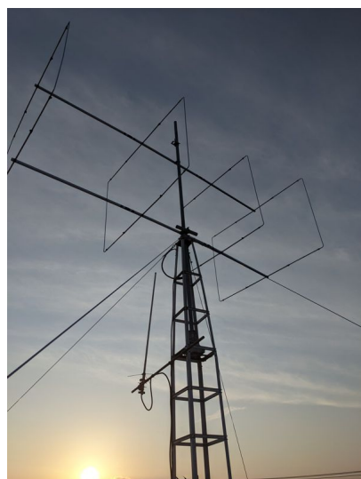
The 4el 50MHz Quad @ JE1AKA

If you want the absolute best performance from minimal boom length and require performance that is available in any weather conditions or simply want something a little different, then the LFA-Q could be the one for you!