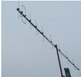
A 10 element low-noise, Professional Series AIS (162MHz) LFA Yagi - For Commercial, Professional and Marine applications