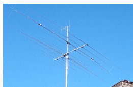
An XR6 below a Delta C-140 Rotating 40m dipole @ OE7MPI

The XR6 standing on it's own in terms of quality. built using the latest CNC technology, all components are at the top of their field too. Our insulators are UV protected and handle -170 to +240 degrees C, our hardware is Marine Grade Stainless Steel and our aluminium aerospace grade T6 6066/6082.