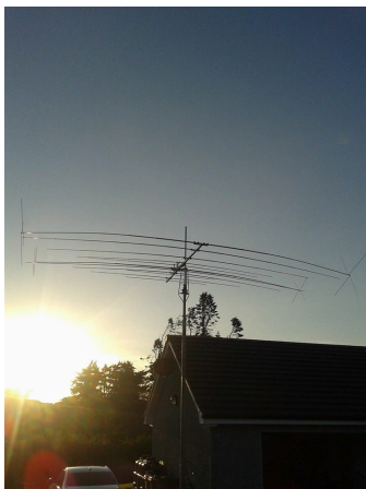
A European version of the XR6C (Compact) installed at GI0TSS (MKII with capacity loading, not yet available)