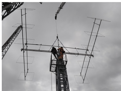
Under the 2 x 5el @ JR3XMG:

"I think this is the first set-up station in Japan so I am very happy and appreciated to use LFA-Q this system"