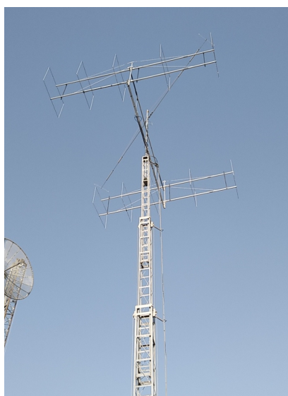
2 x 5el LFA-Q @ JR3XMG - Serious hams need Serious Antennas!

If you want the absolute best performance from minimal boom length and require performance that is available in any weather conditions or simply want something a little different, then the LFA-Q could be the one for you!