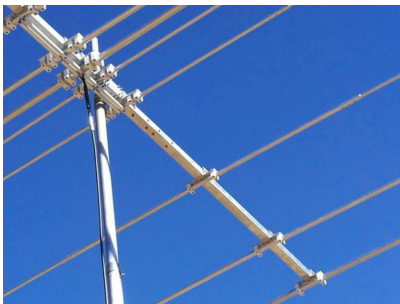
View of the 50mm (2") Sqare boom and element holders on the rear of the antenna