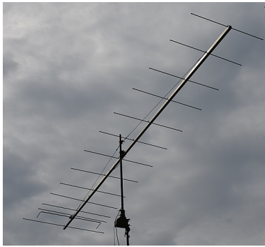
A 14el 88-108 OP-DES