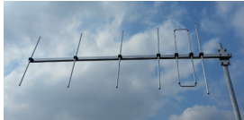
A 6 element low-noise, Professional Series AIS (162MHz) LFA Yagi - For Commercial, Professional and Marine applications