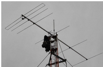
The 6R6 6 element 50MHz LFA-R being installed by XE2K

The 6R6 sits on a 6.5m (21') boom yet punches with a very respectable 12.1dBi gain while still delivering well over 21dB F/B (front to back) ratio.