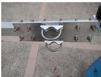
The 6R6 heavy-duty boom to mast assembly with all marine-grade (A4) Stainless Steel hardware

Note: 2 rather than 4 square U-Bolts (boom securing) are used on production models and is more than sufficient.