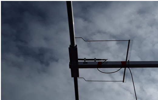
The Large diameter Hairpin of the Delta C-240 that contributes to the exceptional bandwidth of this antenna