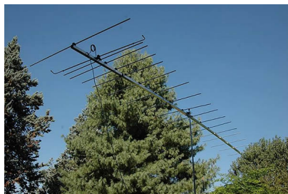
A 18el 88-108 OP-DES pictured

This email address is being protected from spambots. You need JavaScript enabled to view it.